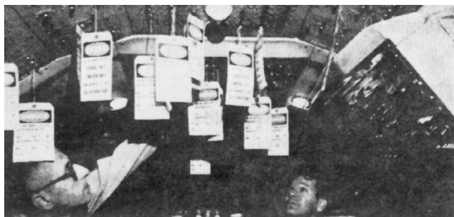
FIGURE A.4.4.7 Use of a Tag-Out System.

A.4.4.8(1) No fewer than two people should work on energized electrical systems in areas containing flammable fluid lines.